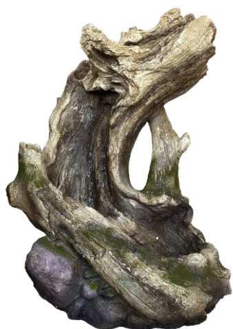
Fountain (LED lights pre-installed)