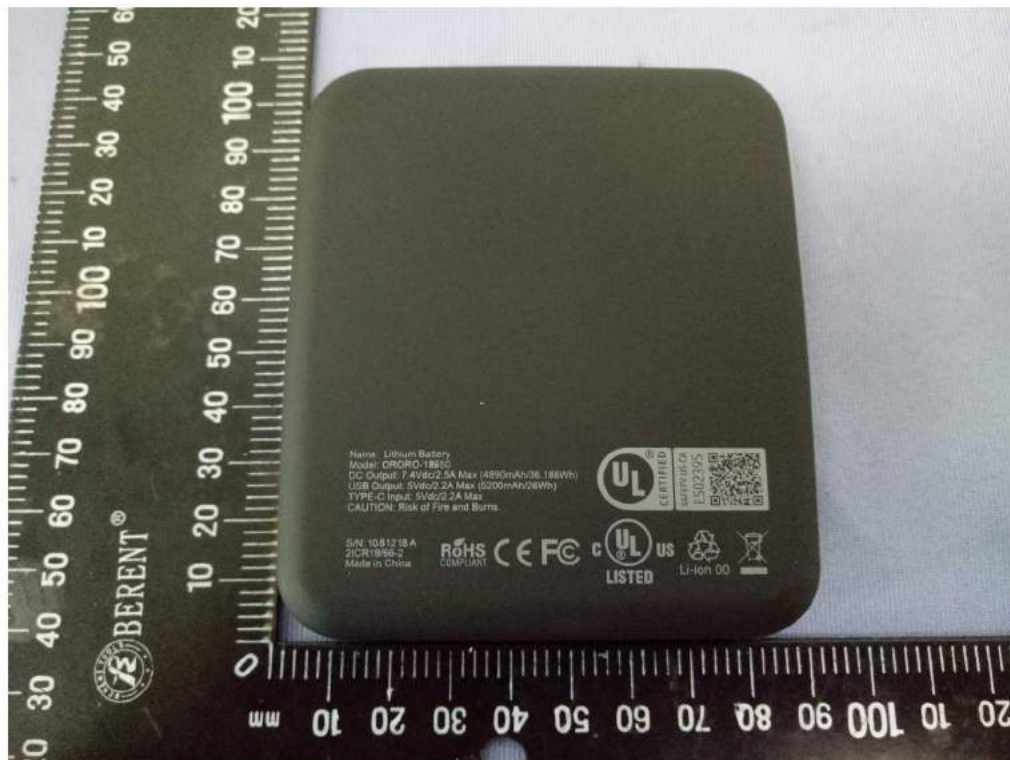
Figure 1 Overall view I of battery