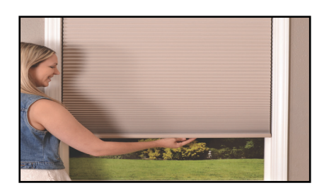
c) Pull shade down to lower and push up to raise.