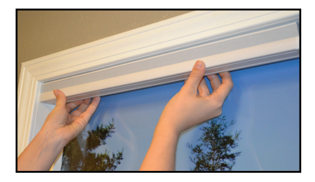
b) Press firmly across width of shade to install.