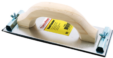
TOOLPRO Drywall Hand Sander #04010