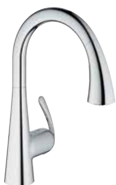
● ● 30 313 000 / 30 313 DC0 Electronic Sink Mixer with pull-down dual spray