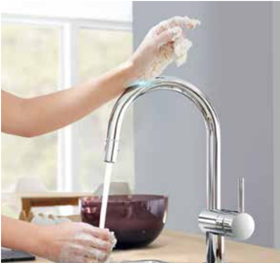
Simple activation/deactivation of the water flow by touch.