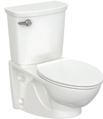
2882107 Combo with Seat 5055A65C