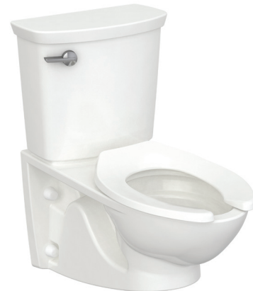
2882107 Combo Wwith Seat 5901100