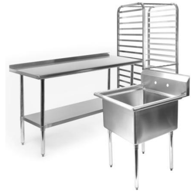
Table and Sink Assembly Instructions