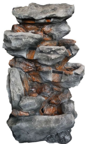
Fountain (5 LED lights pre-installed) 1x