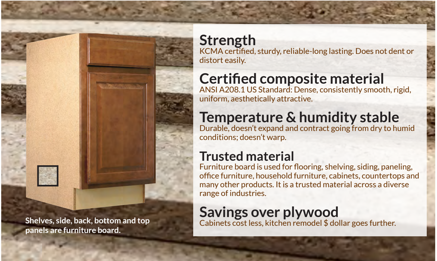
Shelves, side, back, bottom and top panels are furniture board.