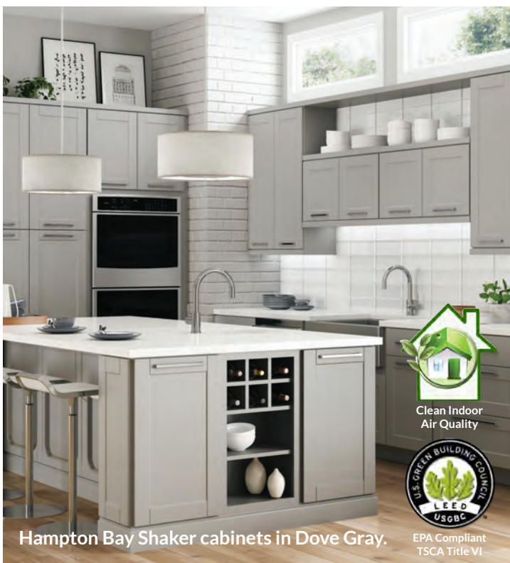
Hampton Bay Shaker cabinets in Dove Gray.

Furniture board is made of reclaimed and recycled wood products, commonly referred to as particle board or engineered wood.