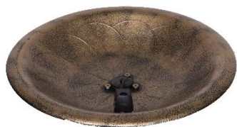
Fountain Basin (Pump Preinstalled)