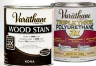
As shown Varathane 3X Wood Stain in Kona, and Varathane Triple Thick Semi-Gloss Polyurethane