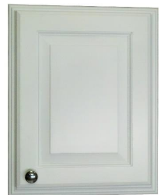
Solid Maple Raised panel door can open either direction

Additional glass shelves as well as other parts and accessories are always available.