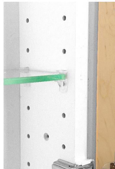
Our own design of shelf supports assures the shelves are more stable, they won't fall off or rock.