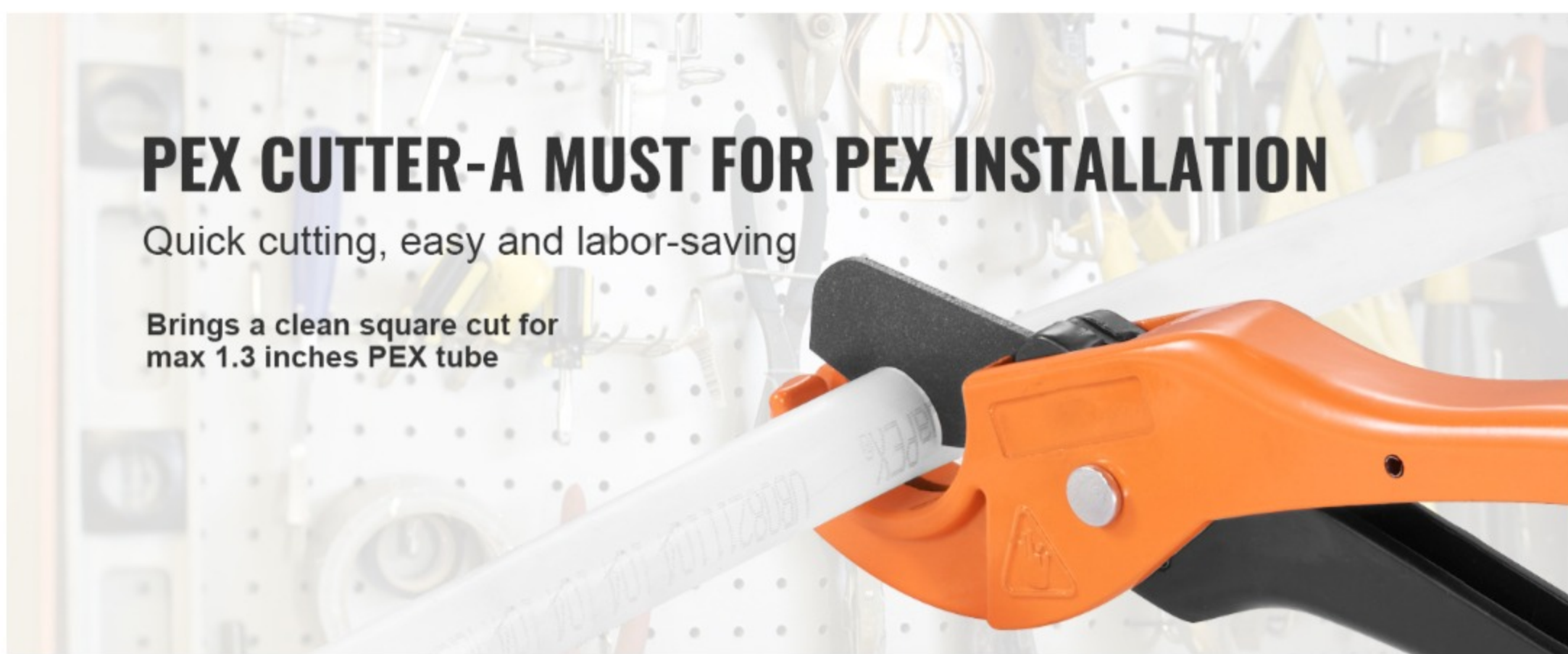
Durable PEX pipe cutter is an essential tool in PEX installations, providing clean cuts for PEX pipes up to a maximum diameter of 1.3 inches. It features efficient cutting performance, ensuring precise and clean pipe cuts for accurate and neat installations.