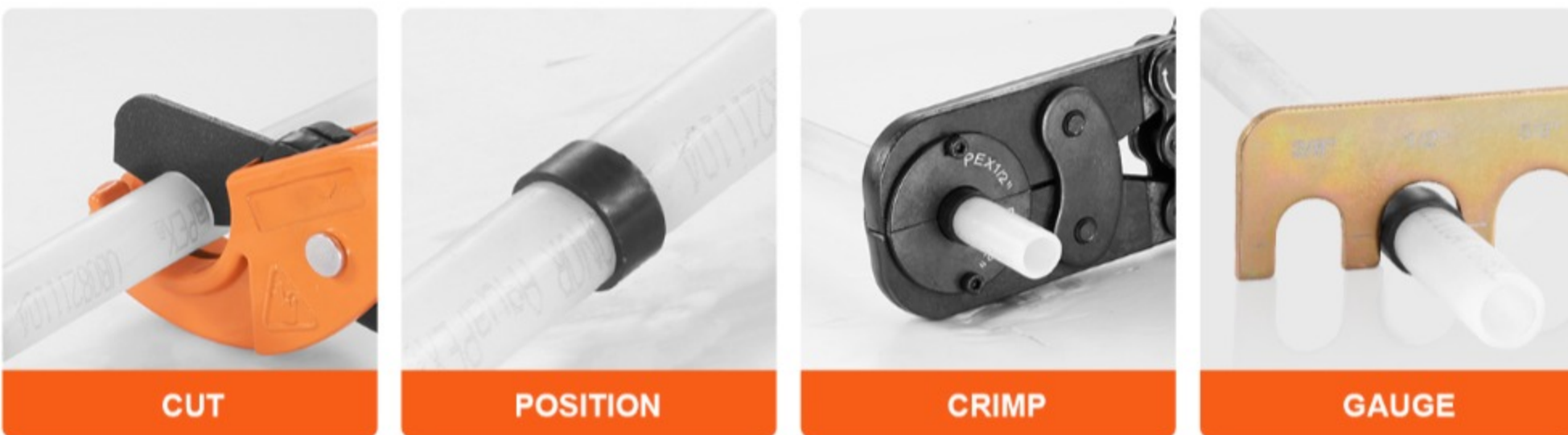
VEVOR crimping tools are easy to operate and offer durability and usability, making them an ideal choice for plumbing and irrigation projects. The simple operation ensures quick and effortless crimping, while their durability ensures reliable performance over the long term.