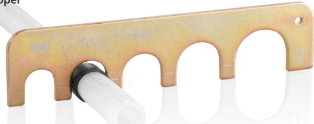
With a GO/NO-GO gauge, successful crimps when the ring slides into groove and stops within the "GO" range. If it fails to pass through the "GO" gauge, crimping is unsuccessful. If the ring crosses the "NO-GO" line, the crimping fails inspection.

Measure each crimp ring to ensure proper crimping and guarantee tool accuracy for every connection