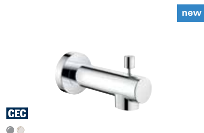
13 366 000/ENO Diverter tub spout Slip fit