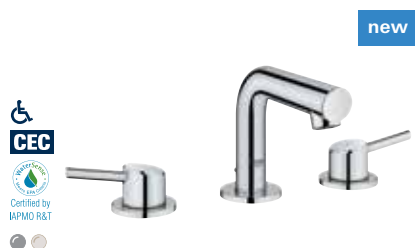
20 572 001/EN1 Lavatory wideset, 1.2gpm