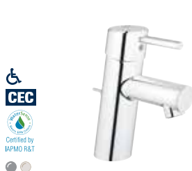
34 270 00A/ENA S-size lavatory centerset, 1.2gpm 34 271 00A/ENA Less drain