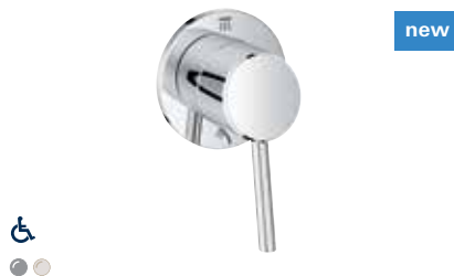
29 108 001/EN1 2-Way diverter trim, Shower head / hand shower