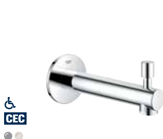
13 275 001/EN1 Diverter tub spout IPS