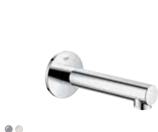
13 274 001/EN1 Tub spout IPS