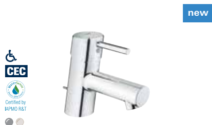
34 702 001/EN1 XS-size lavatory centerset, 1.2gpm