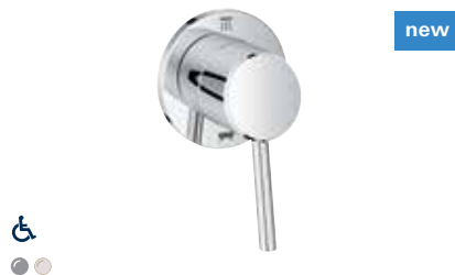
29 104 001/EN1 2-Way diverter trim, Shower head / tub spout