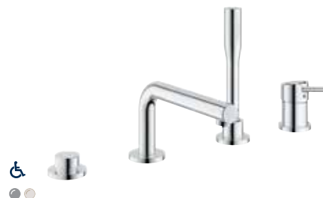
19 576 001/EN1 Roman tub filler with personal hand shower, 2.5gpm