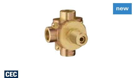
29 900 000 Diverter/transfer 2-way diverter rough-in valve, 2 discrete functions 29 901 000 2 Discrete/1 shared functions