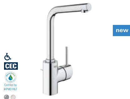
23 737 001/EN1 L-size lavatory centerset, 1.2gpm