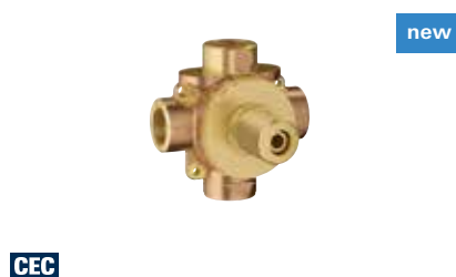
29 902 000 Diverter/transfer 3-way diverter rough-in valve, 3 discrete functions 29 903 000 3 Discrete/3 shared functions