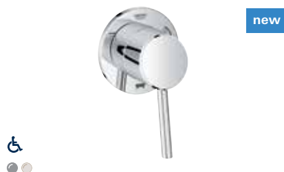
29 106 001/EN1 3-Way diverter trim, Shower head / hand shower / tub spout