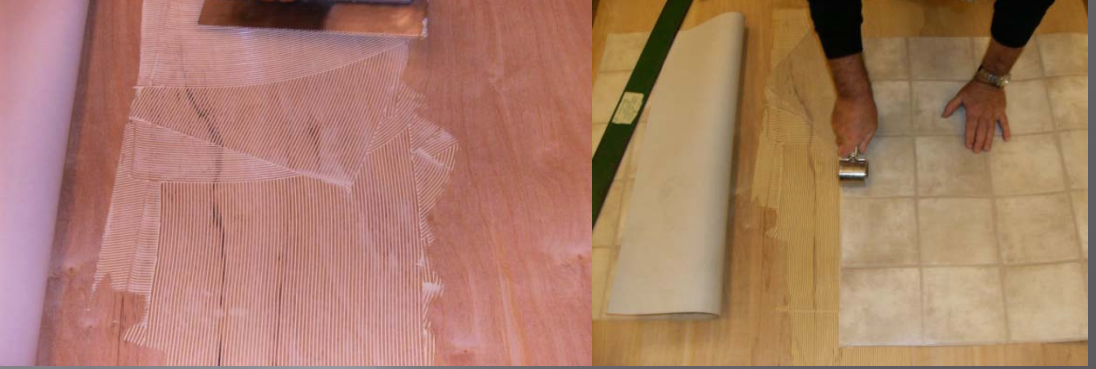
After cutting the seam fold back both pieces and apply adhesive using a regular notch trowel on porous and fine notch on non-porous substrates.