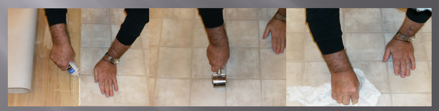
Apply a 1/8" bead of S-761 seam adhesive along the edge