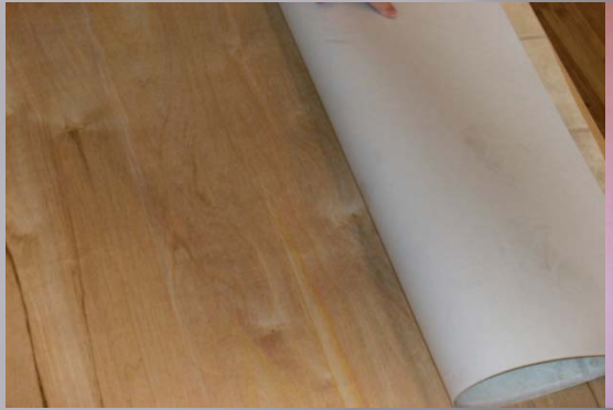
Apply adhesive either full spread or perimeter 12" band around the room. Do Not apply adhesive in the area of the seam Double cut seam dry.

Felt backed products-S-235 or S-254 adhesive (full spread or perimeter glue Armafelt options)