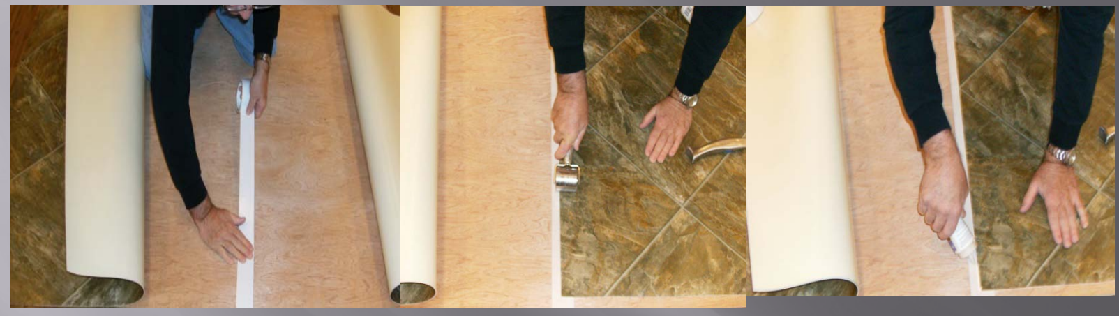
After seam is cut fold back and apply tape