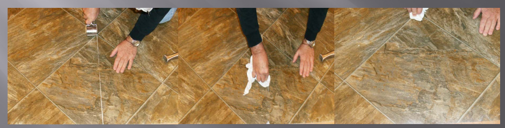
Lay in second piece and hand roll adhesive will ooze up between the pieces