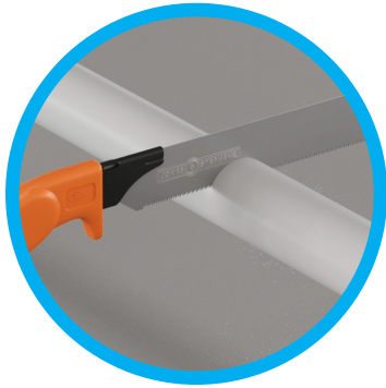
S49005 & S49008 Cuts plastic pipe and wood