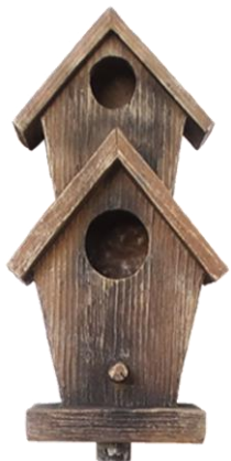
Fountain Top 1x