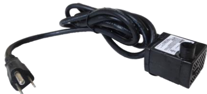
Fountain Pump 1x