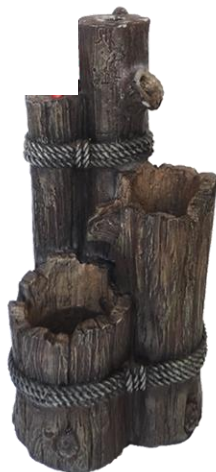
Fountain Base 1x