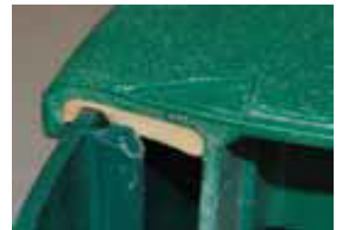
Lids have foamed-in gasket for water tight seal.

Tank Adapter Rings For mounting riser flush to top of tank when casting-in is not an option.