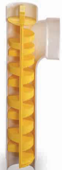
Effluent filters available in 4"