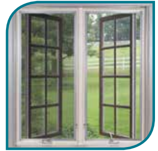
Window above shows standard screen on the left versus Clear Advantage screen on the right.

Visit www.adfors.com to learn more about our products, view our how-to videos and use our screen selector tool to make sure you have the right screen for your needs.