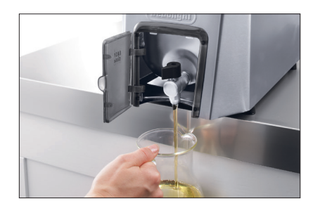
1. EASY DRAINING Leftover oil is quickly and easily removed with the EasyClean draining system.

With the Livenza Deep Fryer with EasyClean System it's easy to gather your friends and family for meals and snacks. Whether it's the enticing aroma of crispy French fries, or the mouthwatering fragrance of homemade donuts, every indulgent treat you prepare will be delicious. And, with its large capacity, be prepared for lots of company!