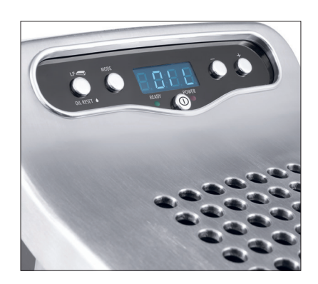
7. COMPLETE CONTROL

The large, 1-gallon oil capacity lets you fry larger quantities for friends, family and even parties.