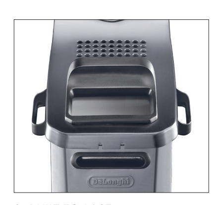
8. BUILT TO LAST

The removable basket makes it easy and safe to take sizzling food out of the oil.