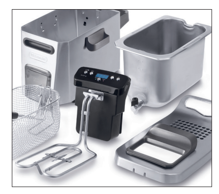
9. NO-HASSLE CLEANUP

Less oil is absorbed into food, leaving you with light and crispy mouthwatering bites.