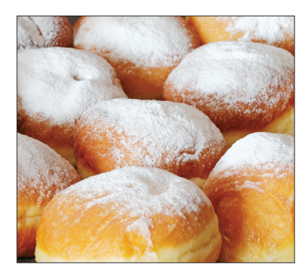
4. COOK FOR A CROWD

The large, 1-gallon oil capacity lets you fry larger quantities for friends, family and even parties.