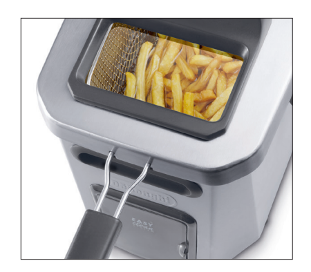
5. FROM THE FRYER TO THE PLATE

The adjustable thermostat gives you the power to prepare foods exactly the way you like them.