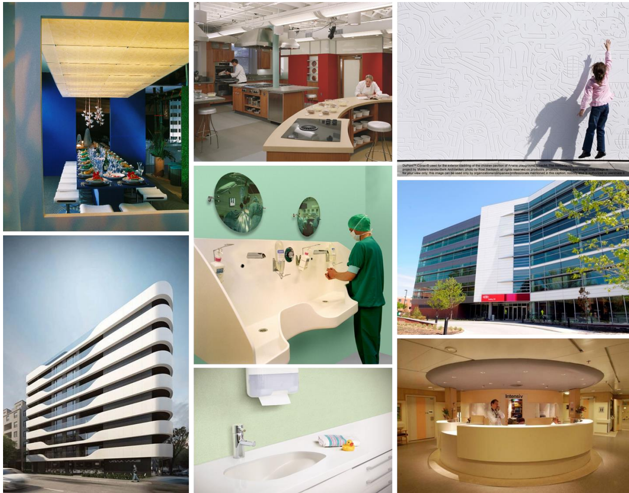
Figure 1: Corian® solid surface in its various applications