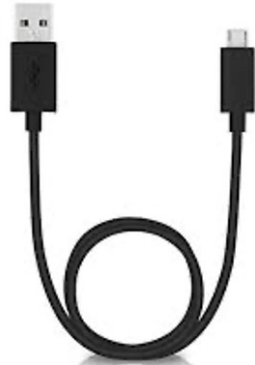
39" Micro USB to USB Charging Cable x1