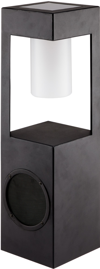
Solar Speaker Lantern x1