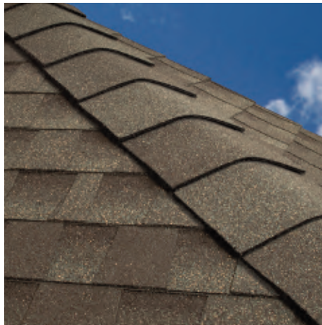
After A distinct finishing look that also protects against leaks and shingle blow-offs