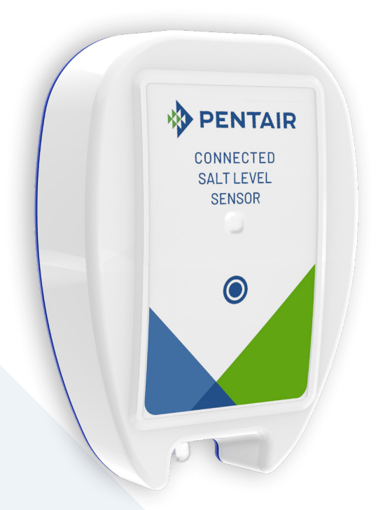
Part No. 4005702