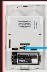
[ Tamper Switch ]

note: The Consumer Unit will sound to indicate sensor has been learned in successfully