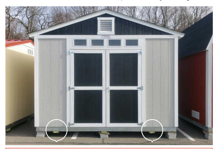
Figure 3 - Display building with wood skids beneath the floor joists

Buildings used as displays will be leveled by placing concrete blocks and wooden shims under the perimeter floor joists only. Display buildings may also include wood skids under the floor joists, which will not be removed or leveled upon delivery. See figure 3.