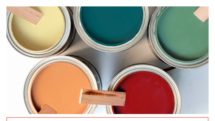
Routine painting is essential to a shed's overall protection