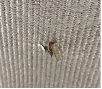
Roofing nails piercing roof decking