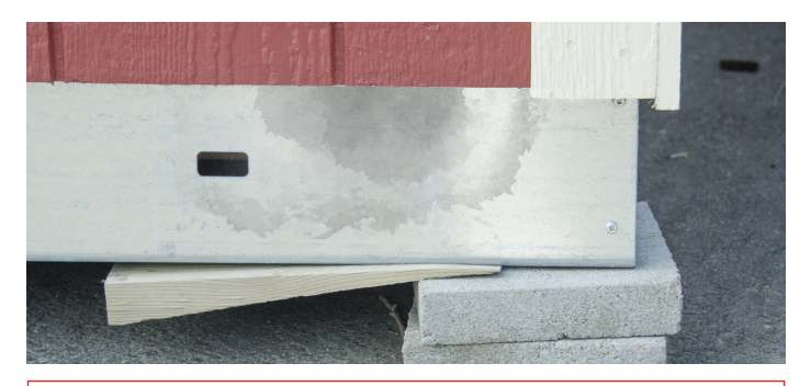
White "chalking" on the steel