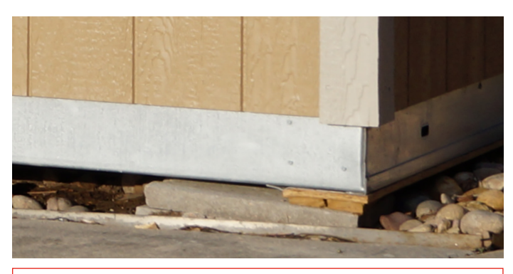
Figure 2 - Close-up of leveling with blocks & shims

Blocking up or "shimming" a building is not always the best solution from an appearance standpoint. Please consider the appearance and your long term satisfaction in the building when making the leveling decision. See figure 2.