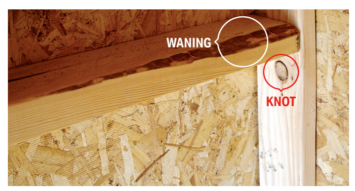
Waning and Knotted Lumber

We use dimensional lumber for wall and roof framing that has been dried, then stored in a controlled environment (our factories) prior to installation. It is unlikely that this wood will have a uniform appearance, and may have blemishes or "waning and knots". This is normal and will not affect the structural integrity of the building.