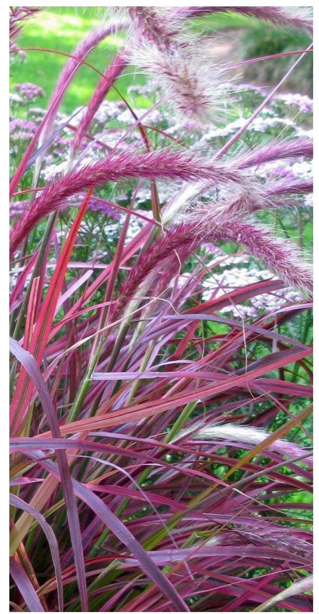
*Image on cover is representative of the type of plant(s) in this offer and not necessarily indicative of actual size or color for the included variety.