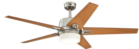
Reversible Maple Finish Blades