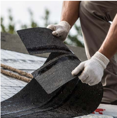
Tears in half easily along perforation for easy installation