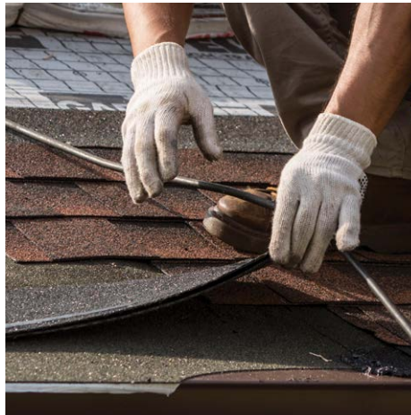
Installs at the eaves and rakes to help prevent shingle blow-off