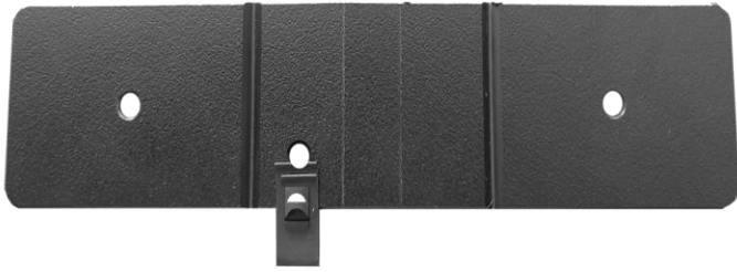
PUSH ON THE U-CLIP