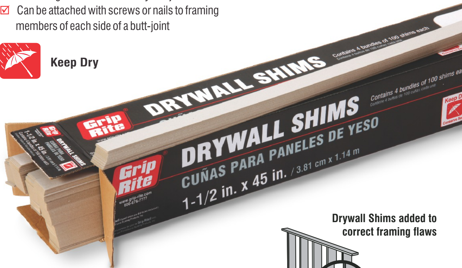
Drywall Shims added to correct framing flaws