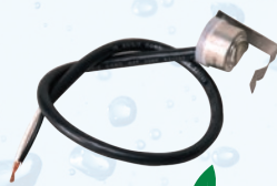
e-smart Resource Saving Products Aquastat