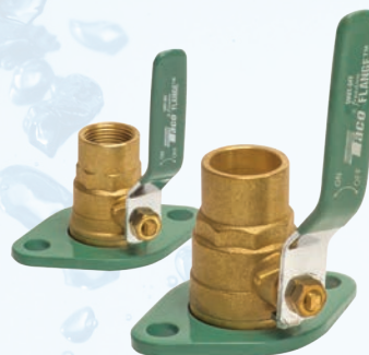
Shut-off Swivel Freedom FLANGE®