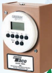
e-smart Resource Saving Products Digital Timer