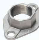
Stainless Steel Freedom FLANGE®