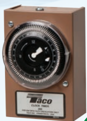
e-smart Resource Saving Products Analog Timer