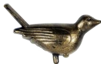
Bird Décor 2x