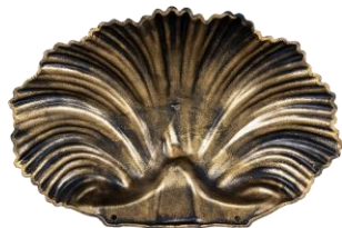
Birdbath Top 1x