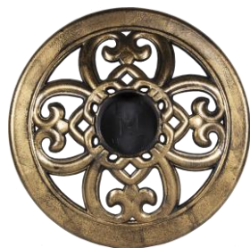
Birdbath Base 1x