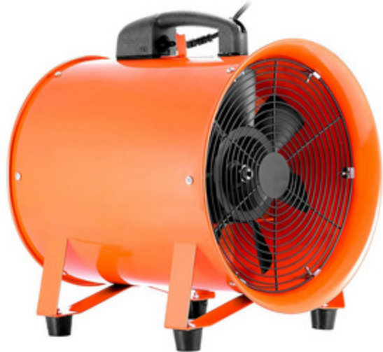
STRONG AC MOTOR