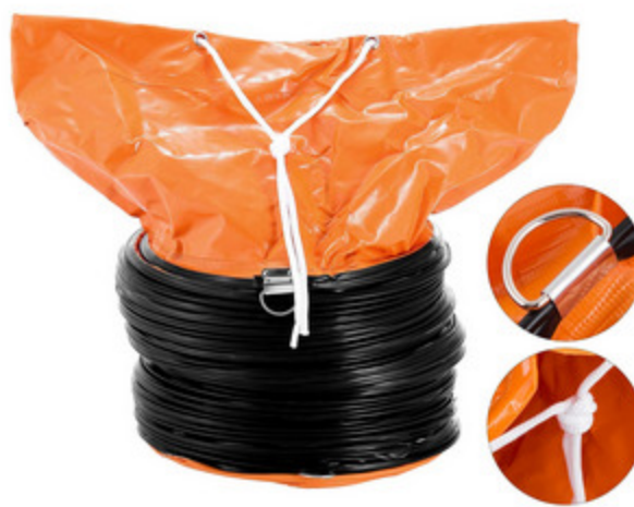
FLEXIBLE PVC DUCTING

Portable and practical with a handle. 4 fixed rubber feet to stand stable.