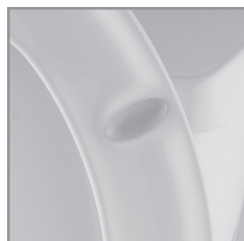
NO-SLIP LUXURY BUMPERS