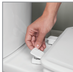
LIFT HINGES TO UNLOCK