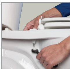
STA-TITE® SEAT FASTENING SYSTEM™