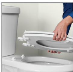
EASY REMOVAL OF SEAT FOR THOROUGH CLEANING