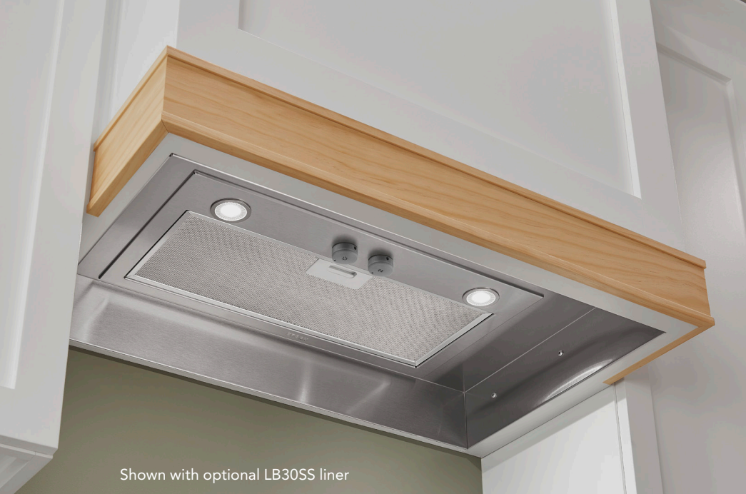
Shown with optional LB30SS liner