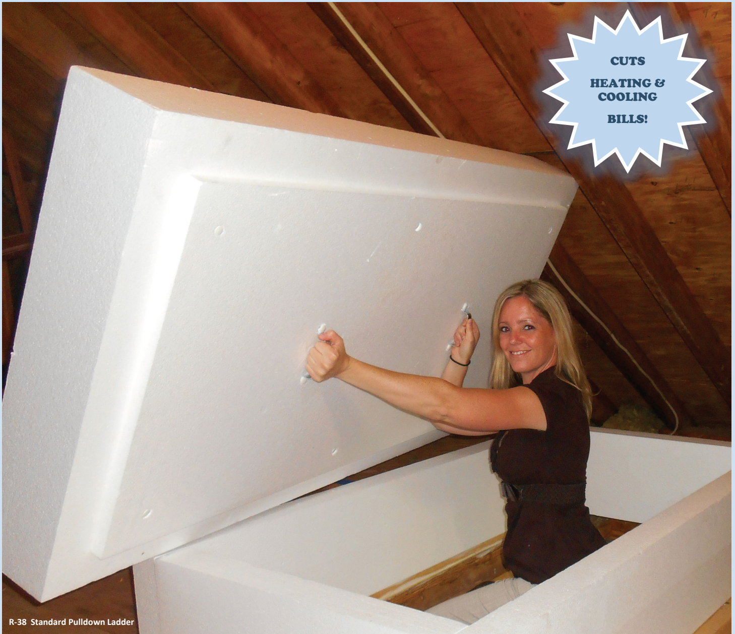
R-38 Standard Pulldown Ladder

Essential for a Comfortable, Energy Efficient Home!