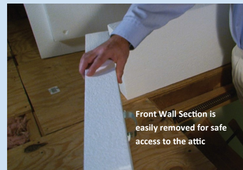
Front Wall Section is easily removed for safe access to the attic