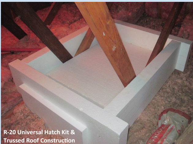
R-20 Universal Hatch Kit & Trussed Roof Construction

Do It Once, Do It Right! The Energy Guardian Kits!