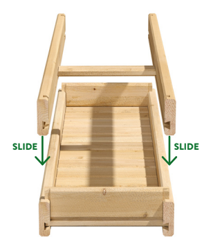
Slide the Top Layer over the ends of the Dovetail Bottom Boards to connect it with the Bottom Layer.