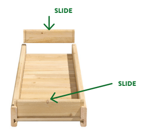
Once the floor is built - insert the last two Dovetail Bottom Boards into the Routed Side Boards .