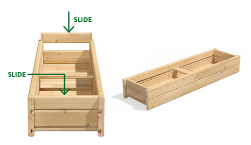
Lastly, insert the Dovetail Top Boards into the Routed Side Boards . Plant and enjoy!