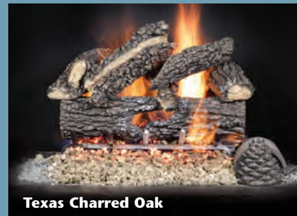
Texas Charred Oak