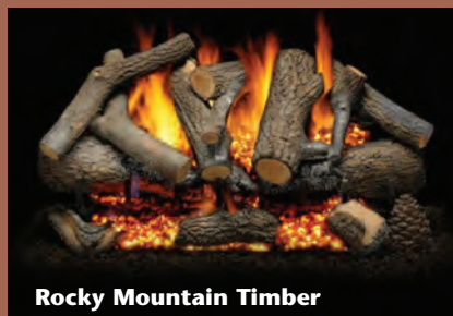
Rocky Mountain Timber