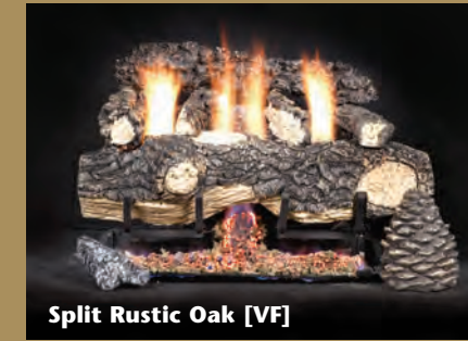
Split Rustic Oak [VF]