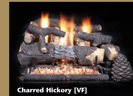
Charred Hickory [VF]