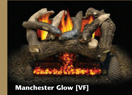
Manchester Glow [VF]