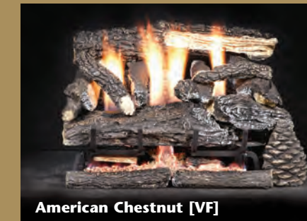
American Chestnut [VF]