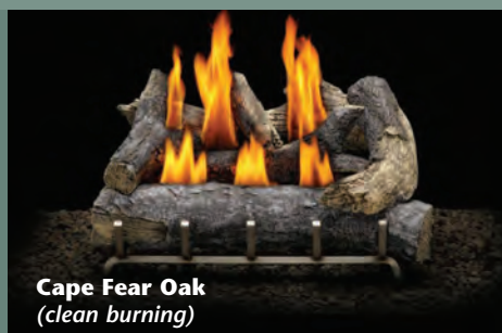
Cape Fear Oak (clean burning)

All outdoor gas logs are available in LP or natural gas. All outdoor log sets have stainless steel gas burners for outdoor use.