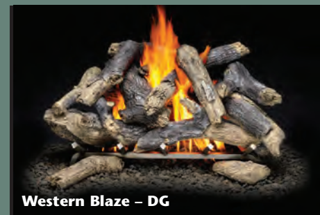
Western Blaze - DG