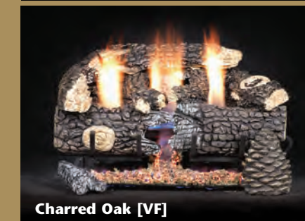
Charred Oak [VF]