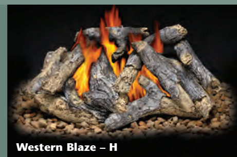
Western Blaze - H