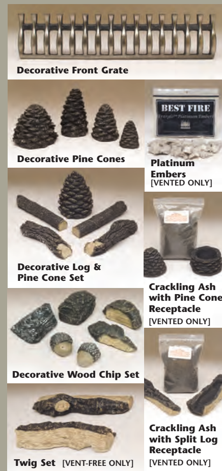
Decorative Front Grate

BEST FIRE gas log accessories are available to enhance the look and enjoyment of our gas log sets, providing the ultimate in fireplace comfort and convenience.