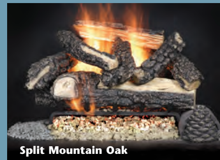
Split Mountain Oak