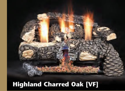
Highland Charred Oak [VF]

Combining luxury and efficiency with distinctive design elements. The efficient burner design combined with no outside venting requirement prevents heat loss and drafts.