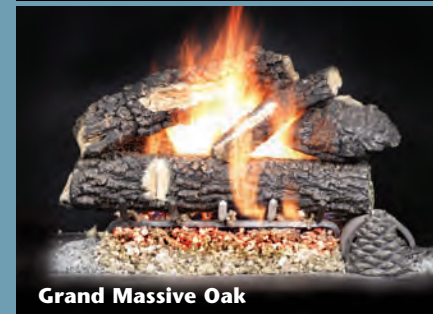
Grand Massive Oak