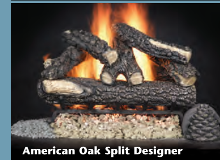
American Oak Split Designer