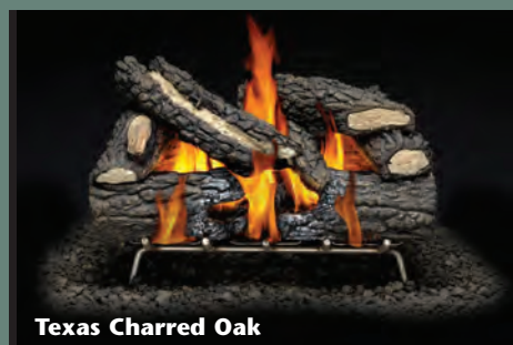
Texas Charred Oak