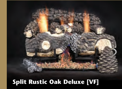
Split Rustic Oak Deluxe [VF]