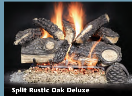
Split Rustic Oak Deluxe