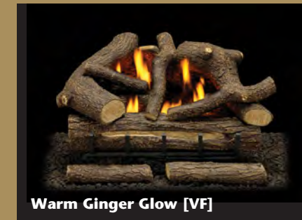
Warm Ginger Glow [VF]