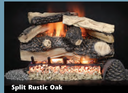
Split Rustic Oak