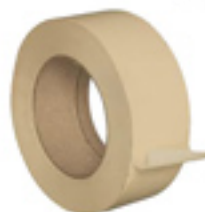
2" Masking Tape