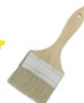
3" Chip Brush