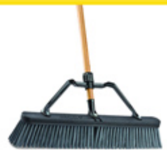
Stiff Bristle Push Broom