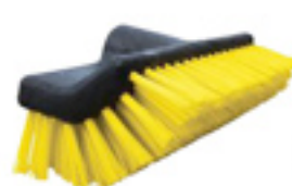
Unger Pro Bi-Level Brush 10"