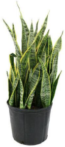
SHIPPED IN A 10-INCH POT. PLANT SIZE MAY VARY BASED ON GROWING CONDITIONS.

Note: Some leaves may appear wilted or yellow upon arrival. This is due to the stress of shipping and is nothing to worry about. Water the plant and let it recover in a shady location for a few days, then gently remove any foliage that does not recover to allow for new growth.