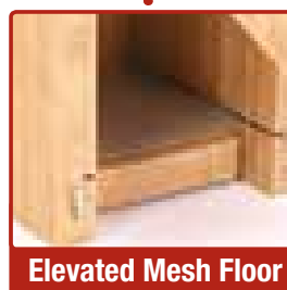
Elevated Mesh Floor

Rust-free hardware includes stainless steel screws and galvanized steel mesh