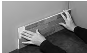
Beginning from inside corner on right, place the first tile.

a) For backsplash. Working from lower right to left, make sure the overlap notch is always in the upper left position as shown in image below/right.