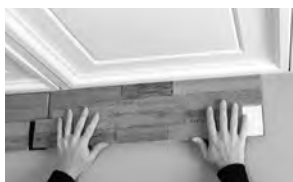
Moving left to right, use overlap notches to abut tiles, just as you would in a backsplash installation.