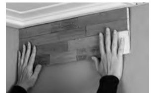
Beginning from inside corner on right, place the first tile.

Start your first tile at the upper left corner of your accent wall area. Abut the first tile to the ceiling or topmost termination point if not a ceiling.