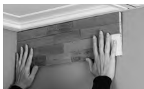
Beginning from inside corner on left, place the first tile.

b) For an accent wall. Working from upper left to right, make sure the overlap notch is always in the lower right position as shown in image below/right.