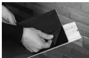
Method 1 - The adhesive on the back side of the Aspect tiles is engineered to be aggressive and pressure-sensitive.

If you are using installation Method 1, proper wall preparation is required. Aspect can be installed over most structurally-sound substrates if they are clean, flat, smooth, dry and free of dust, wax, soap scum and grease. Acceptable substrates are drywall, plaster or clean, smooth tile (glazed, porcelain-type tile; not porous or textured). Any damaged, loose or uneven areas must be repaired, patched, leveled and primed. Fill cracks and irregularities with wallboard compound or spackling, then sand smooth with fine-grade sandpaper.