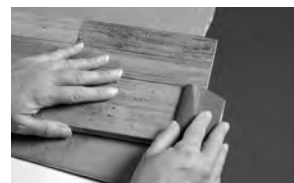
Sanding tile edge.