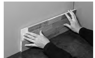
Beginning from inside corner on right, place the first tile.

The easiest layout method for a backsplash is to begin from the inside corner of your countertop and work across from right to left. This method allows you to use two points of reference, your vertical wall and horizontal counter top. Note—when using these two points of reference, be sure to check them for level on the horizontal plane and 90° on the vertical plane. This will prevent any problems as you build your backsplash.