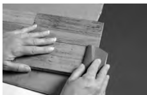
Sanding tile edge.

a) For backsplash. Working from lower right to left, make sure the overlap notch is always in the upper left position as shown in image below/right.