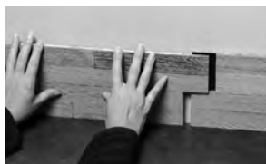
Install next tile as shown.