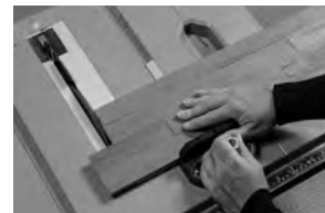
A table saw can also be used for straight cuts.