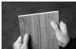
Straight cut edge with notch removed.