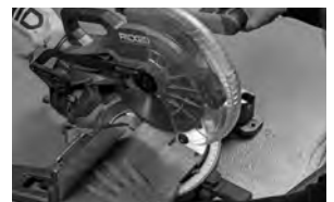
Cut away the notch with a miter saw.