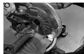
A powered miter saw is recommended for straight cuts.

Many types of edge trims can be found at your local home center. Wood tile edges sanded smooth look great too. If a cut edge showing exposed wood doesn't match, use stain to color the edge to your satisfaction. See our FAQs at www.aspectideas.com for stains that match our wood tiles.