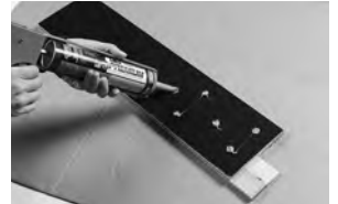
Method 2 - Using high-quality polyurethane construction adhesive.

Method 2: If you do not intend to prepare, sand and prime the surface, an additional adhesive should be used. We recommend a high-quality polyurethane construction adhesive be applied to the back of each tile. Be sure to remove the release film on the back of each tile before applying additional adhesive. Apply some pea-sized dots of adhesive to the back of a full tile (see right). Keep the adhesive a half-inch from the edges. Firmly press the tiles into place. If adhesive squeezes out around the tiles, be sure to wipe it off before it dries.