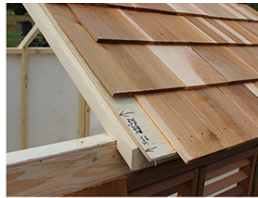
Join the Right and left panels. Once in place put the filler shingles to waterproof the roof