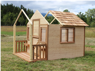
Set the roof panel making sure it sit half way on the rafter. The edge must be exactly on the ridge

The next step is to take the other panel and set it beside the first one.