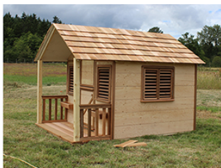
Do the other side of the roof