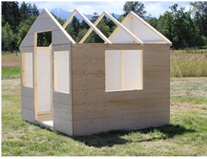
Join the rafters and set them evenly on the side walls

The next step is to set up the front porch.