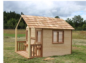
The second roof panel will be set beside the first Make sure the top edge is exactly on the ridge so the other sides will close tight.