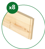
Side Walls (4) long (4) short