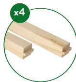
Floor Support Blocks (2) long (2) short