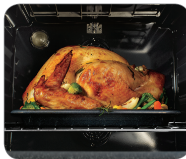
5.9 cu. ft. Capacity

Fingerprint Resistant Black Stainless Steel