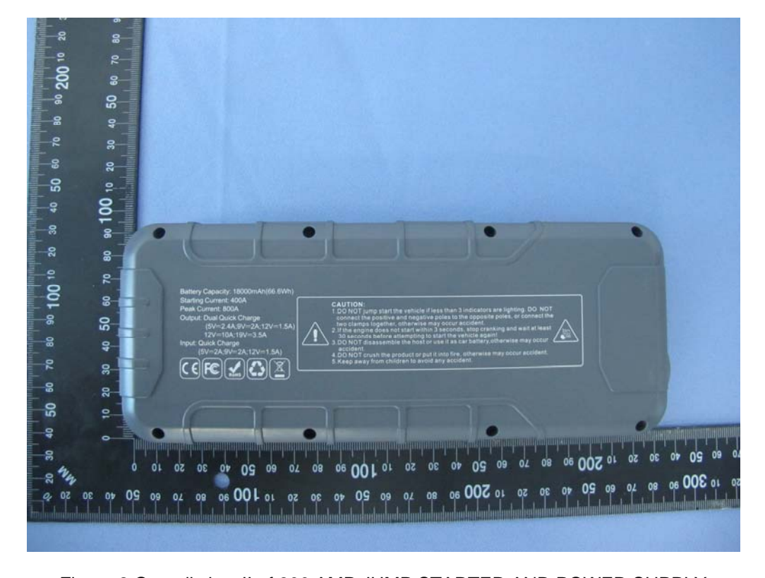
Figure 2 Overall view II of 800 AMP JUMP STARTER AND POWER SUPPLY