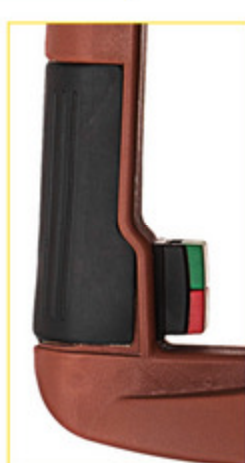
Manual Remote Control