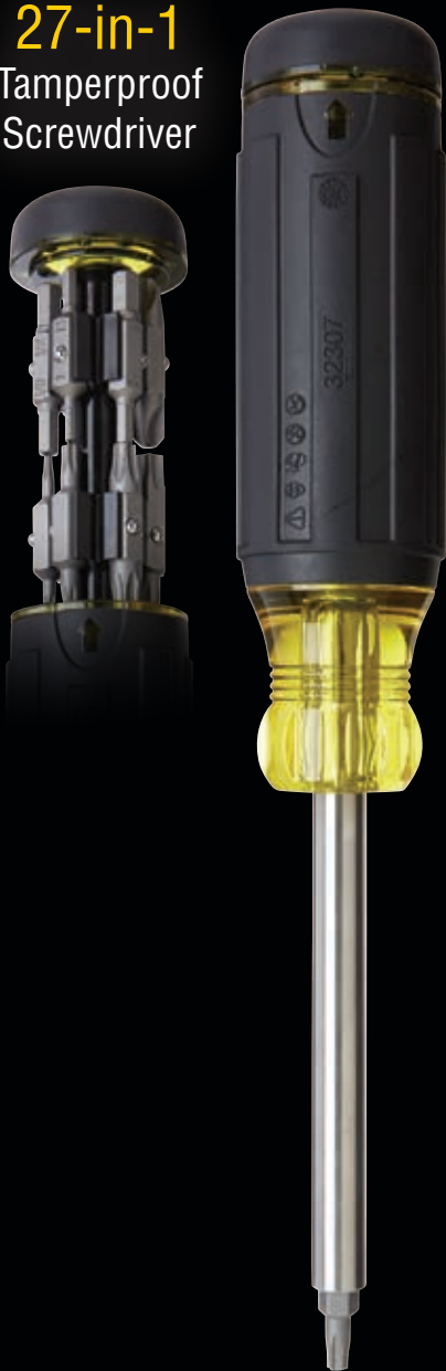
27-in-1 Tamperproof Screwdriver