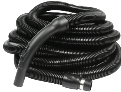
Fig.1 Hose with no switch.

» APPLICABLE TO ALL POWER UNITS: in order to avoid overheating, we recommend 12 in / 30 cm clearance all around the power unit.